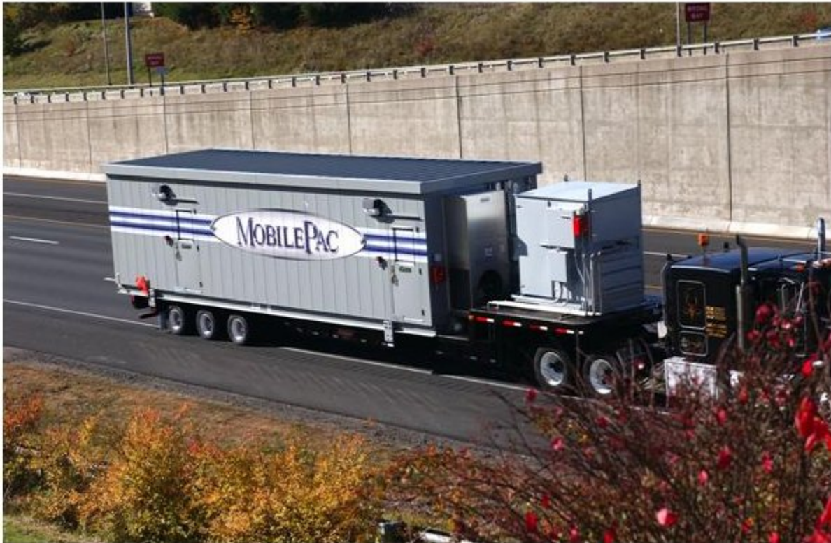
Figure 4: MOBILEPAC Control Trailer on the Interstate

The control trailer is approximately 50 feet long by 11.5 feet wide and 13.5 feet high.