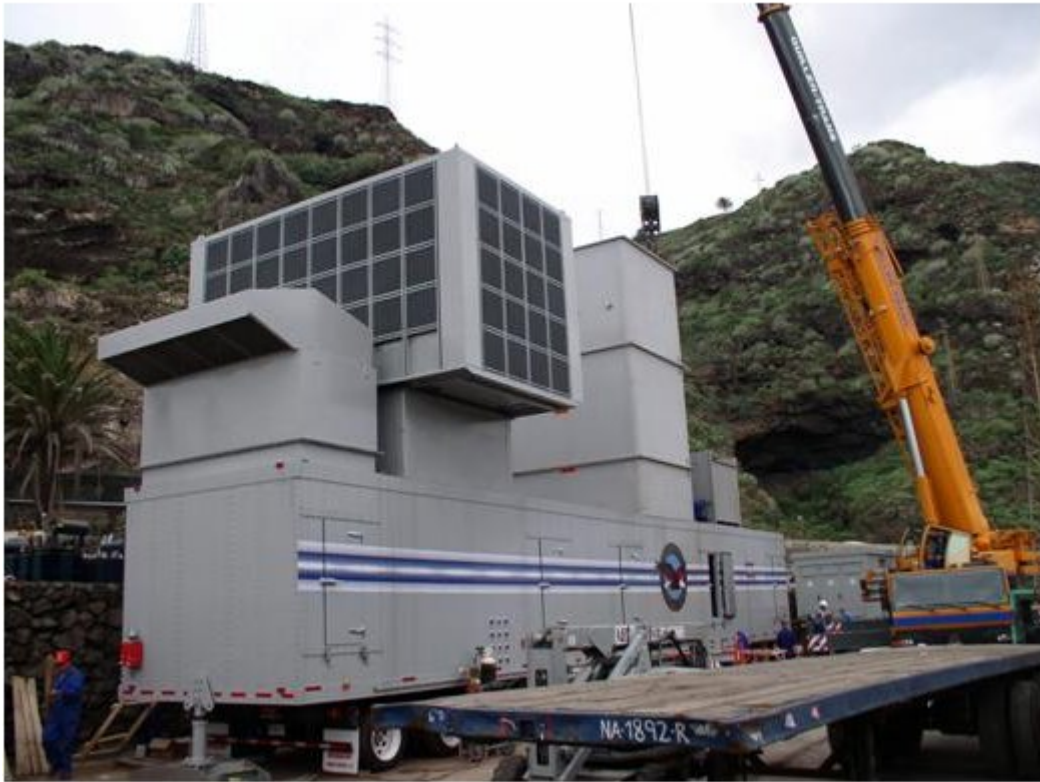
Figure 5: Assembly of Power Trailer

Upon arrival, air suspension at the front and rear of the power trailer are inflated to take up the load and lift the trailer, the jeep is unhitched and removed, and the trailer leveled using the jack plates. After the jacks are set and locked, the air bags are deflated.