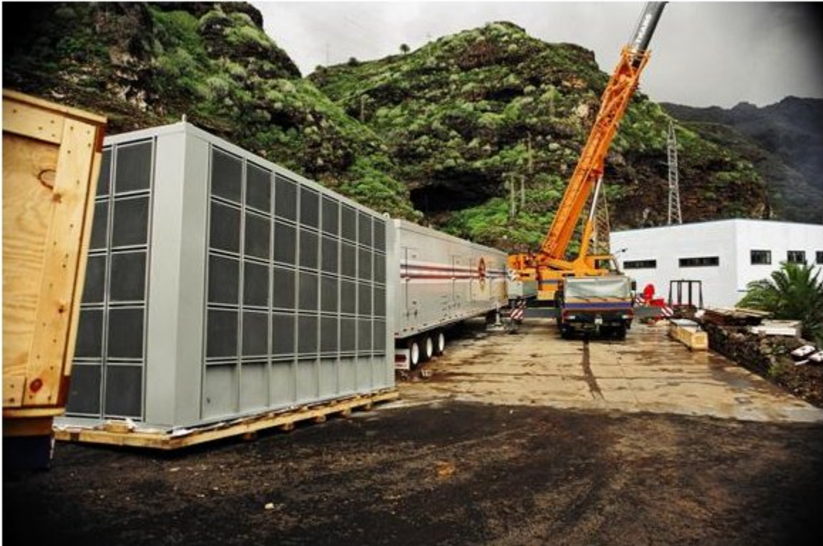
Figure 7: Mobile Site in the Canary Islands

other hardware that might be in the way. If necessary, the gas turbine and power turbines can be easily hoisted out of the removable power trailer roof. If it is ever necessary to remove the generator, the generator end wall of the trailer is also easily removable. Maintenance access to both the turbine and generator lube systems is also excellent thanks to a total of 10 full size access doors provided on the power trailer.