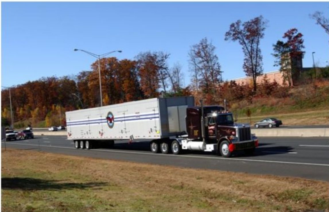
Figure 3: MOBILEPAC Power Trailer in transit on the Interstate.

The power trailer is transported to its site by a jeep and wheeled tractor that fits to a pivot pin under the front of the trailer. In addition, a hydraulically steered bogey located towards the aft end of the power trailer increases maneuverability on tight roads and simplifies positioning the trailer upon arrival at site. The power trailer suspension is equipped with an air ride system to absorb road shock and pneumatic jacking capability to adjust for road clearance. This trailer is approximately 65 ft long by 12 ft wide and 13.5 ft high. Significant clearance was design on the underside of the trailer to accommodate highly crowned or undulating roads.