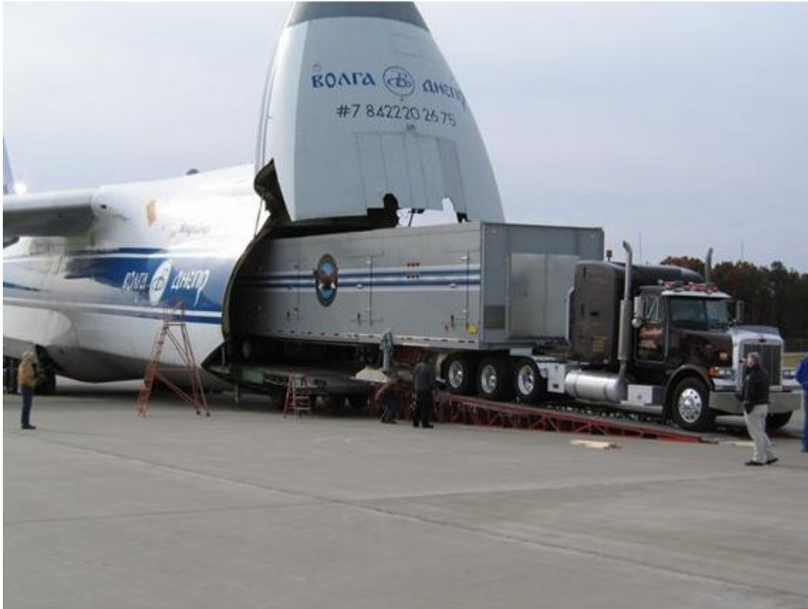
Figure 6: Trailers are designed for Air Shipment